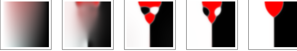
Figure 2: Phase separation process for a mirror-symmetric initial value. There occur metastable states. Finally, the phases are separated by a straight line and circular arcs. Moreover, the final state is a global minimizer of the free energy functional F under the constraint of particle number conservation.

Note that for all u, \hat{u} \in \mathcal{L}^\infty(T) , all t \in (0, T] , (\tau, x) \in (0, t) \times U and \delta > 0 the identity